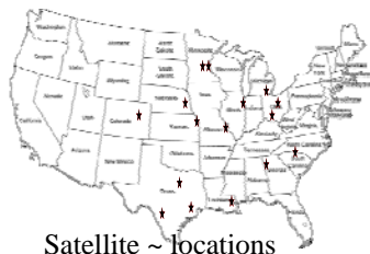
Satellite ~ locations

Dealerships: Satellite ~ see map for locations Tri-Plex Breathing Air ~ Beaumont, TX.